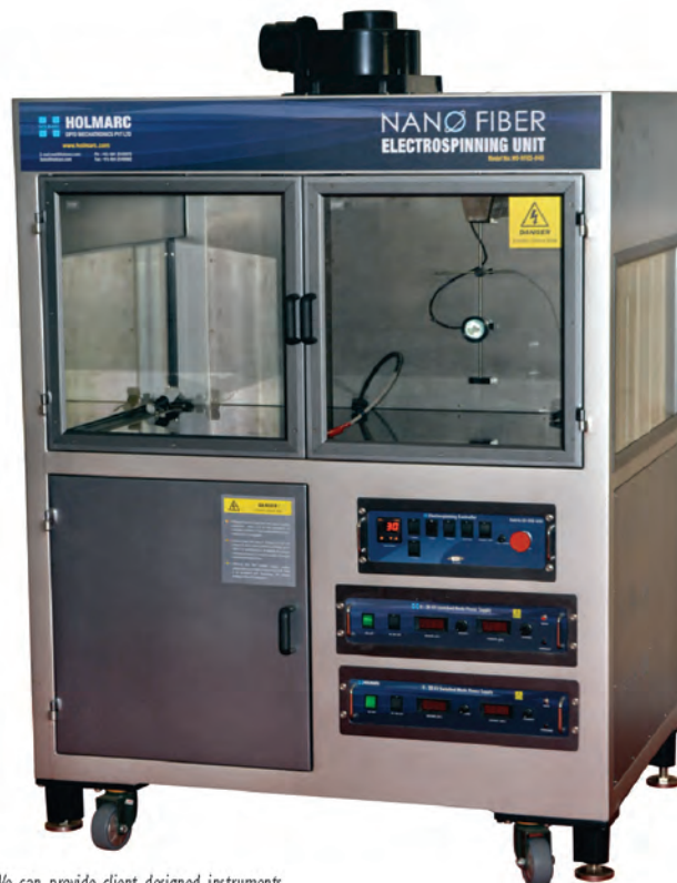
We can provide client designed instruments on special order. For more details, please contact us

HO-FH-01 model fume hood provides an enclosed atmosphere with transparent side walls to monitor the electro spinning process. The inbuilt heater can raise the process temperature up to 45°C. A common electronic control unit is integrated within the hood. The hood also has features like exhaust fan, granite work surface and optional features like high bright halogen lighting and duct of custom dimension which can be connected to an exhaust duct (available onsite).